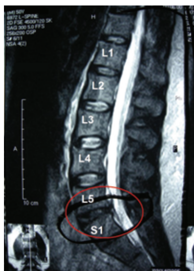
Figure 1b: Post-treatment MRI (03/14/05)