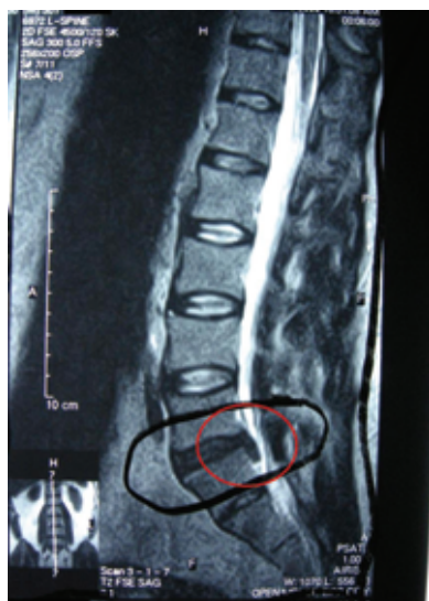
Figure 1a: Pre-treatment MRI (02/02/05)